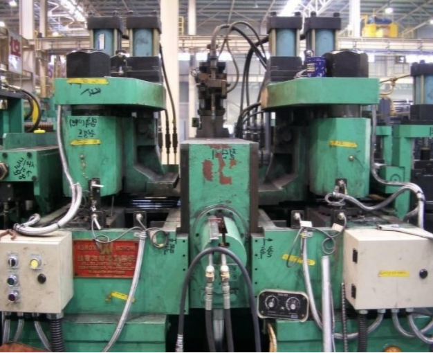
SHEARING & WELDING